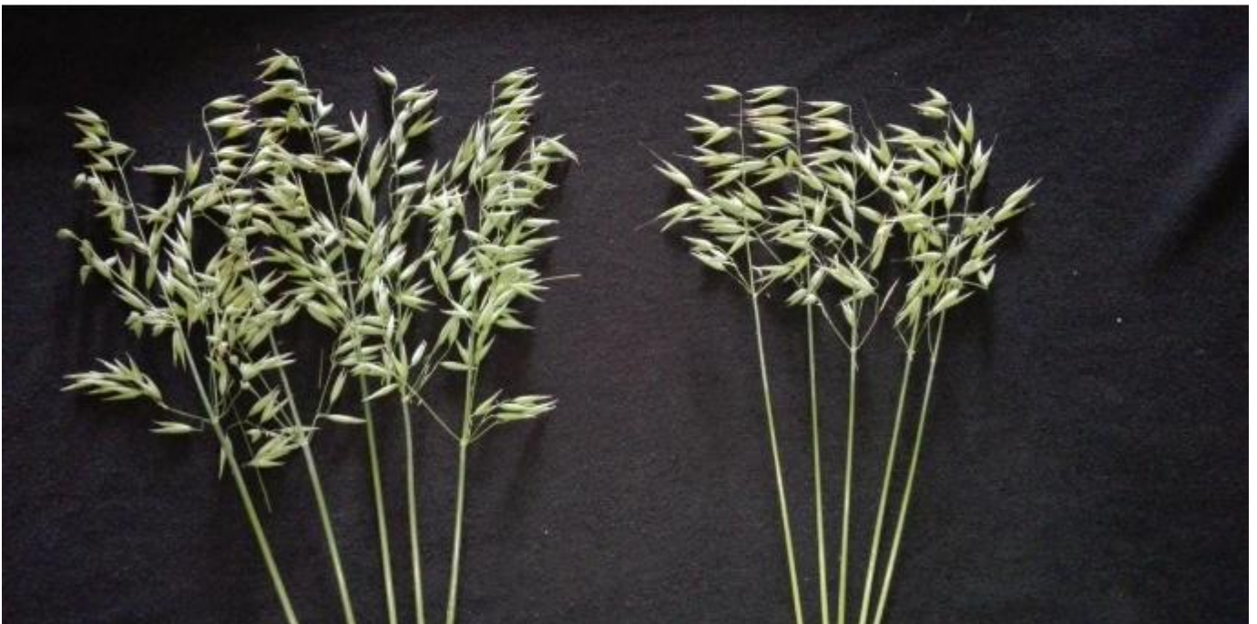
Left: with Sapropeet yield of 6.7t per hectare